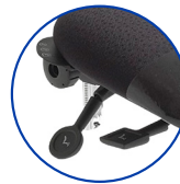
200mm pneumatic lift with 13 1/4" height adjustment