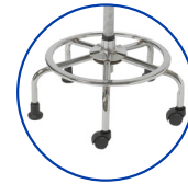
18" foot ring for extra durability