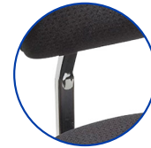
4" of back height adjustment