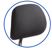
Fully upholstered backrest