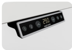
Pre-settable Memory Positions