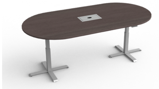
Height Adjustable Meeting Table