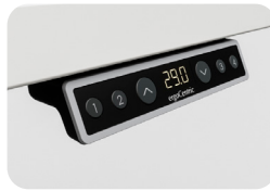
Pre-settable Memory Positions