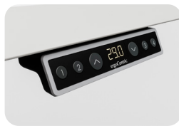
Pre-settable Memory Positions