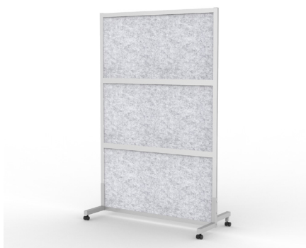
Full Size Double Sided Acoustic Panel