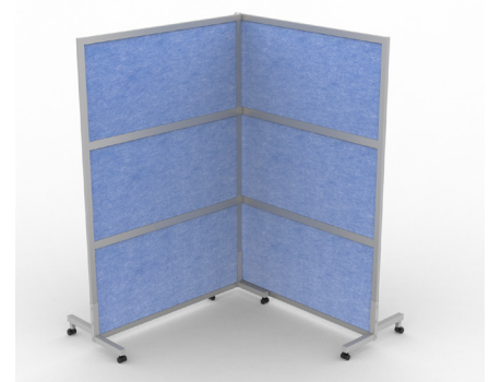
Full Size Double Sided Acoustic Panels placed edge to edge in a 90° angle