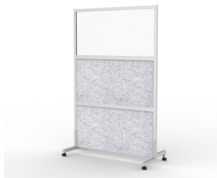
Double Sided Acoustic Panel with Frosted Acrylic Top