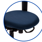
Tailored upholstery on seat pan