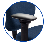
Multiple seat, caster and arm options