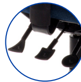
Wide range of adjustments available