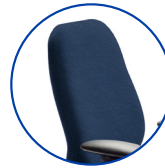
Dual curve backrest