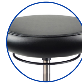
Easy to use height adjustment activator