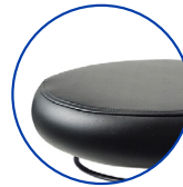
Tailored upholstered seat