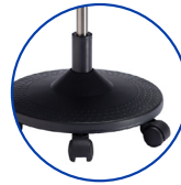
Multiple lift and caster options