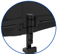
Post System for Scalability and Modularity