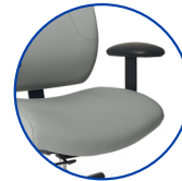
Heavy duty polyurethane foam