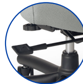
Wide range of adjustments available