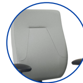
Fully upholstered dual curve backrest