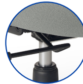
Super heavy duty lift