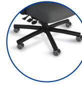
26" steel base