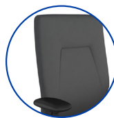
Heavy duty back support