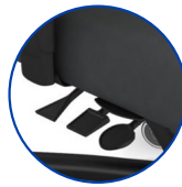
Plus Size Multi Tilt mechanism