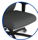
Heavy duty, dual curve polyurethane foam