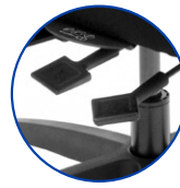
Wide range of adjustments available