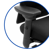
Multiple seat, caster and arm options