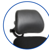
Adjustable headrest (optional)