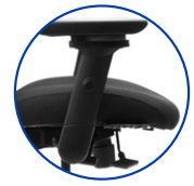
2 1/2" seat slider