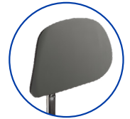
Fully upholstered backrest