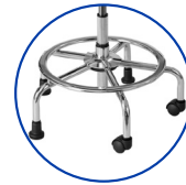
8 ½" foot ring height