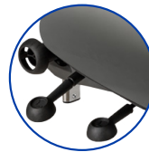
200mm pneumatic lift with 13 ¼" height adjustment