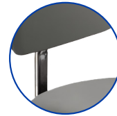
4" of back height adjustment