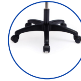
26" Glass reinforced aluminium base