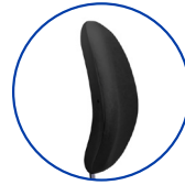
Dual curve backrest