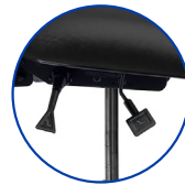
Wide range of adjustments available