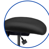
Dual density foam