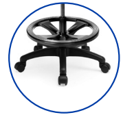
20" Footring available on ergo 2F 200 Tilt