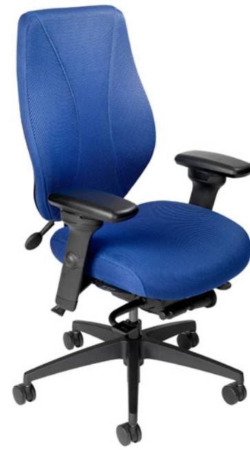
Upholstered seat & backrest