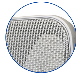
Light Grey mesh and frame

Both the tCentric Hybrid™ seat and backrest are made from elastomeric mesh with fill yarns made from polyester allowing air, body heat and water vapor to pass through. When stretched, this material yields excellent load-bearing properties and resiliency, showing less than 5% load-bearing loss when tested according to BIFMA standards.