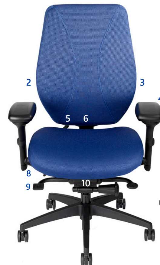
Upholstered seat & backrest