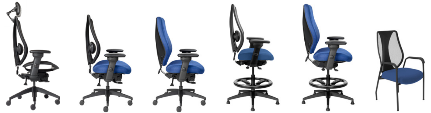
All mesh shown with optional headrest